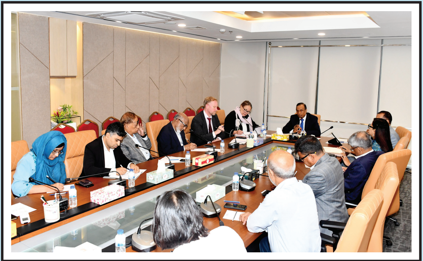
Meeting between FBCCI and the World Bank